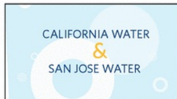
V/O: California Water and San Jose Water.