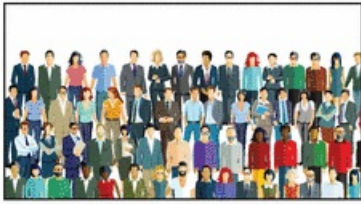
GFX: Customers pop into view intermittently

V/O: But what about customers in the San Jose area?