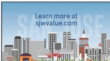
V/O: Local Focus. Local Jobs. Local Savings.