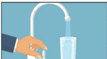
Music: UP FULL AND UNDER V/O: A common-sense...