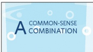
V/O: combination of...