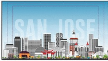
GFX: skyline of San Jose appears

V/O: But what about customers in the San Jose area?