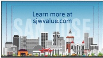
GFX: Logo disappears and the info appears in its place

V/O: Local Focus. Local Jobs. Local Savings.